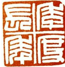
Figure 1: Huang Mufu's seal carving style (Bing, 2012).

Huang Mufu's seal carving style is very much based on the traditional Yishan school of seal art but, of course, pushes beyond that boundary and into modern sensibilities that reflect his personal concept of artistic freedom and individual expression (Bing, 2012). This section goes into specific elements that characterize Huang's work, an account of how each feature was a dialogue between preservation and innovation.