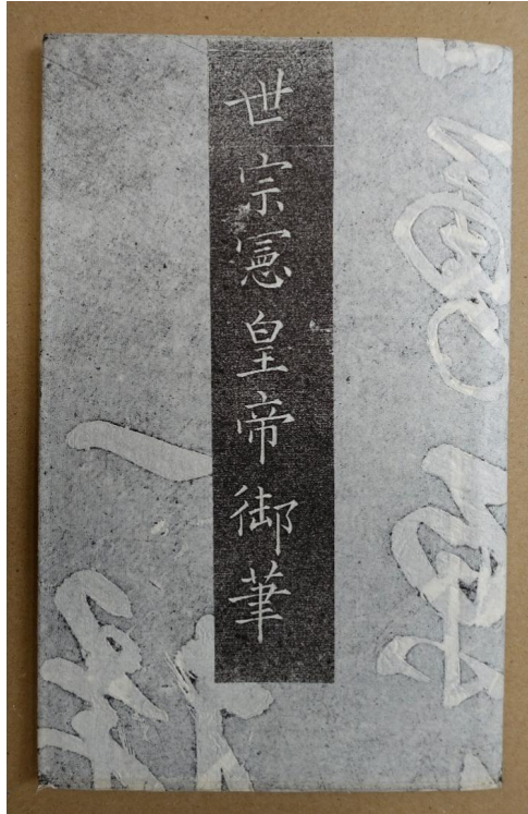
Figure 3: Yishan style (Xizhi, 2024).

The artwork in Figure 3 represents the traditional Yishan style through its structured calligraphic elements. The center vertical part features precisely written Chinese characters that highlight both the strictness and balanced layout principles found in authentic seal art traditions. An aesthetic of cultural longevity combined with historical background comes from the fading writings that surround the artwork.