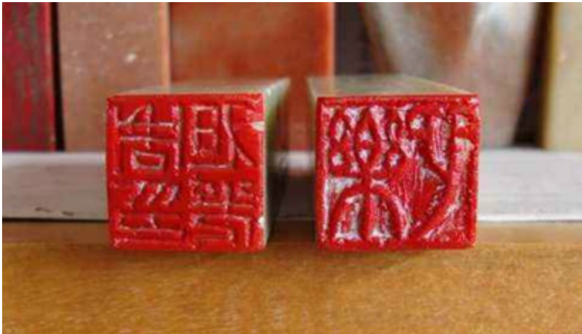
Figure 2: Huang Mufu's Bold Strokes (Zhang, 2021).

Figure 2 showcases Huang Mufu's bold approach to seal carving, where clean, sharp lines contrast with the traditional soft curves typical of the Yishan style. For example, in many of his seals, Huang used clean, almost calligraphic lines: visual opposites to the soft curves and organic forms that are usual in the Yishan style. Those bold lines not only modernize his work but also reflect something of Huang's own way of being fluid with tradition. In working with the seal carvings made by Huang, it is easy to look into his style of bold strokes as more a stylistic choice, but upon closer investigation, he intends to make a statement about how tradition's nature evolves (Zhang, 2021). With the use of the elements of surprise and tension in his piece, Huang throws the expectations of the viewer off regarding what traditional seal art should be, so the need to reassess the narrow lines between tradition and modernity arises.