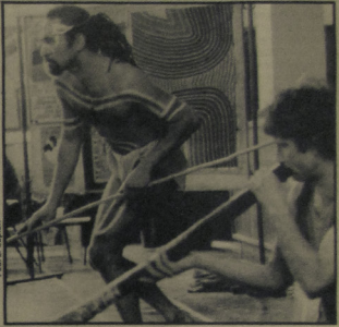
Wind of change: a performer in the Woodwind company helps evoke the atmosphere of an Aborigine dance in a play about the declination of black Australian culture presented at the International Education Fair in London.

lobby of the county council. "It could mean the entire primary residential service will go as the equivalent of 45-5 full-time teachers who provide the service are on part-time temporary contracts." "We know also of a further 75 primary teachers on fixed-term contracts who are at risk," he added.