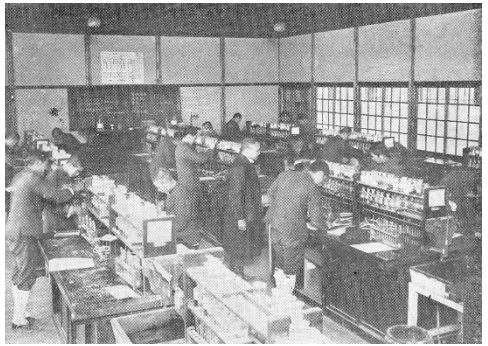
Plate 2 : Class in a chemistry laboratory, Hiroshima.